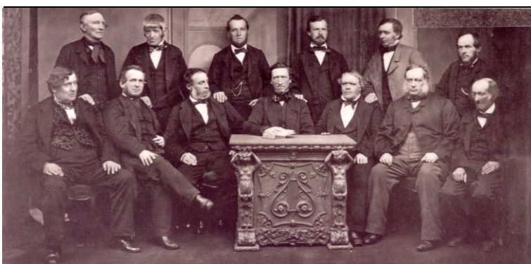
13 of the original 28 Rochdale Pioneers